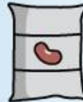
Rice and Beans