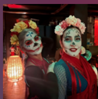
PHOENIX WORLD COLLECTIVE FLAMENCO DANCE