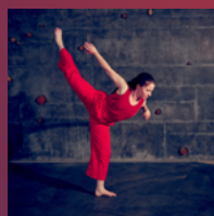
CONDER/DANCE MODERN DANCE