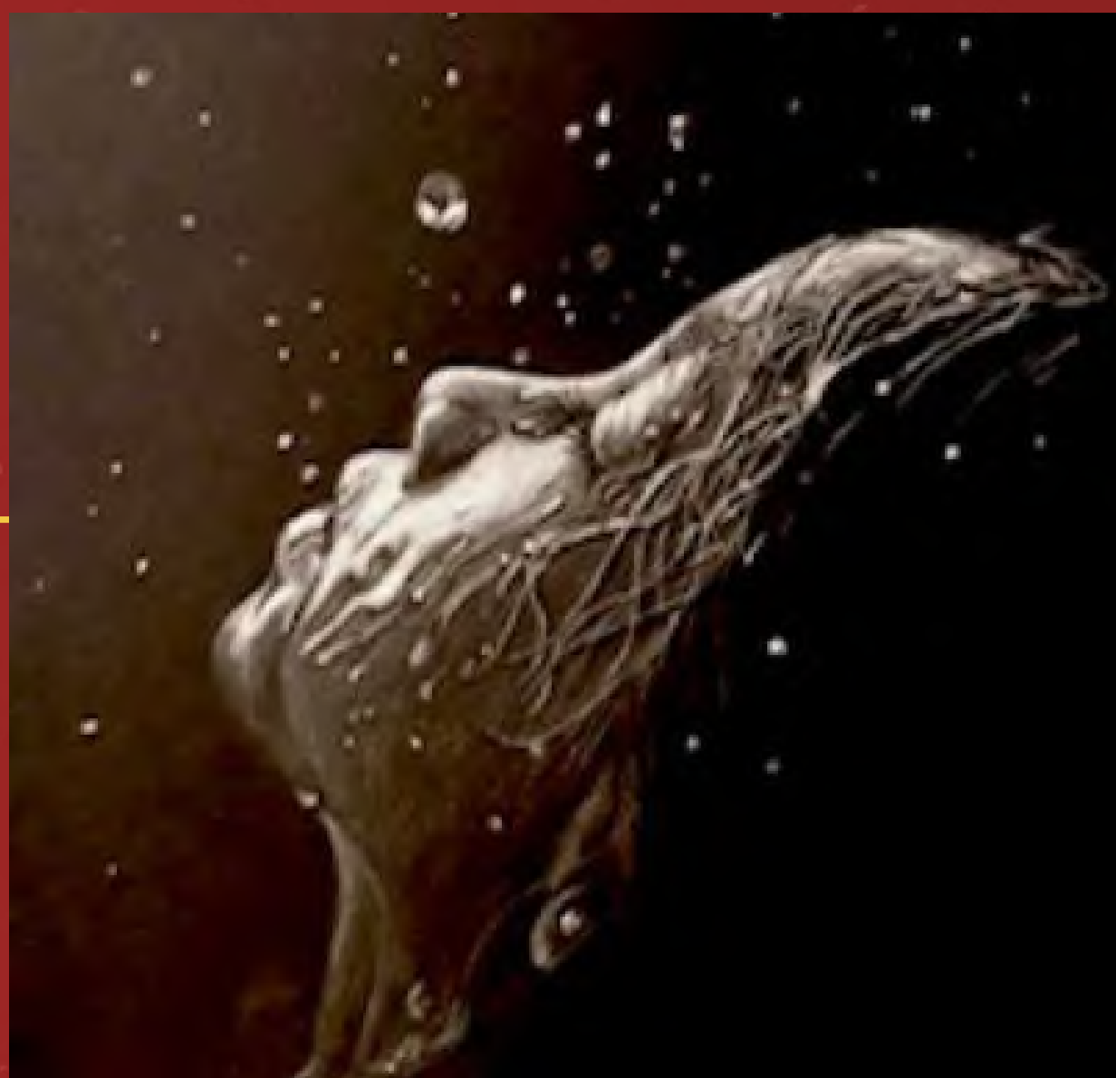
SOUND AND TOUCH OF RAINDROPS BY SUCHETA BAKHLE