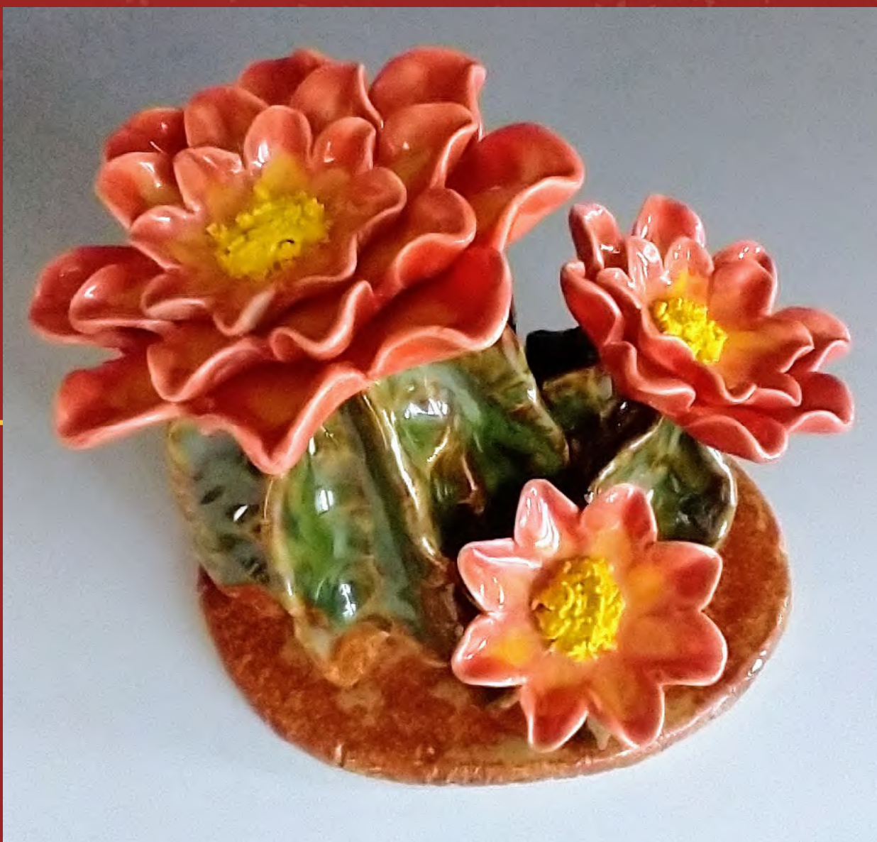
BLOOMING BARREL BY MELANIE MEAD

A portion of each piece sold benefits the Herberger Theater's youth education and community outreach programs. The gallery is located on the second level and open Mon-Sun, 12:00PM to 4:30PM and during performances.